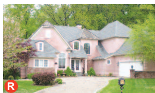
R 307 Lyons Circle Doylestown $985,000 Rte. 202 S to R on Street Rd, pass York Rd, R on Avignon Way, L on Lyons Circle.