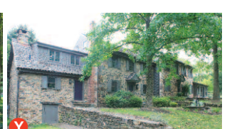
Y 368 Thompson Mill Road Upper Makefield $1,595,000 River Rd S, R on Lurgan, L on Eagle, R on Thompson Mill, gated property on L