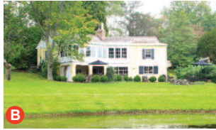
B 1966 Pleasant View Road Coopersburg $659,000 From Doylestown: 611 N L on Rte 412, L on Rte 212 thru Springtown, R on Pleasant View Rd to Prop on L