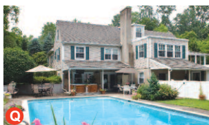
Q 6670 Upper York Road Solebury $669,000 Rte. 202 S, R on Sугan, R on Upper York (263)