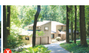
X 28 Solebury Mountain Road Solebury $625,000 Rte. 202 S, L on Aquetong, R on Solebury Mountain.