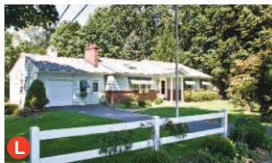
L 7021 Swagger Road Point Pleasant $399,000 River Rd N to L on Ferry Rd, R on Tollgate to R on Swagger, Prop on L