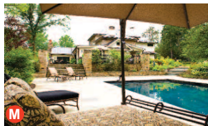
M 5447 Carversville Road Buckingham $1,495,000 Rte. 202 S to R on 413 N to R on Carversville, Prop on R