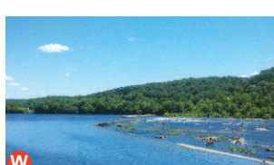
W 350 S. River Road # B2 Waterworks $585,000 New Hope River Rd S to Waterworks on L