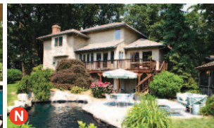
N 3086 Comfort Road Solebury $1,495,000 Rte. 202 S, R on Sугan, R on Upper York (263), L on Comfort, Prop on R

X Possible diversions signs, roads and bridges closed for repairs.