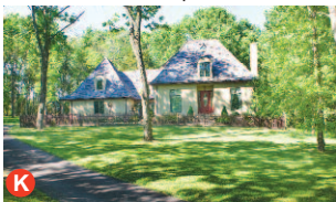
K 348 Cafferty Road Pipersville $1,295,000 River Rd N, L on Cafferty, bear L at Twin Lear, Prop on R