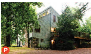
P 2977 Comfort Road Solebury $479,000 Rte. 202 S, R on Sугan, R on Upper York (Rte263), R on Comfort, R on private lane

All directions are from New Hope unless otherwise specified