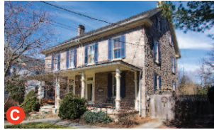
C 135 Delaware Road Riegelsville $215,000 From Doylestown: 611 N to R on Delaware, Prop on L