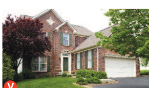
V 117 Lakeview Drive New Hope $485,000 River Rd to R on Riverwoods, R on Deer Path, L on Lakeview. Prop on R