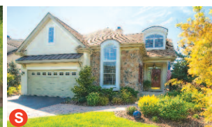
S 424 Snowy Owl Lane New Hope $660,000 Rte. 202 S to R on Silvertail, R on Snowy Owl.