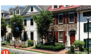
U 17 Canal Street New Hope $799,000 Main St. S, R on Mechanic. Model home, 5 Mechanic on R