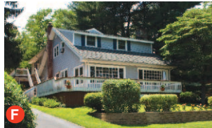
F 1406 River Road Upper Black Eddy $595,000 River Rd N (about 1/2 mile S of Upper Black Eddy bridge)