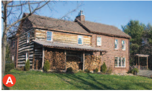
A 830 Ebert Road Coopersburg $547,000 From Quakertown: Rte 212 N, bear L to saty on Richlandtown Pike, cross State St. L on Ebert

An opportunity to view a sample of our current listings, all in one afternoon