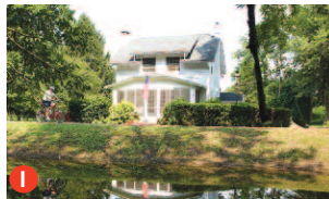
I 8 Cross Creek Lane Erwinna $575,000 River Rd N, L on Cross Creek, L on Towpath