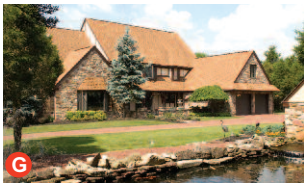
G 590 Geigle Hill Road Ottsville $795,000 River Rd N, L on Headquarters Rd, bear R in Village of Erwinna onto Geigle Hill Rd. Go about 4.5 miles. Prop on R.