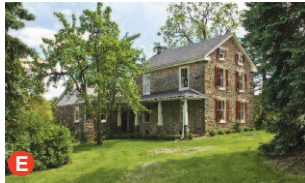
E 2765 Winding Road Quakertown $429,000 From Springtown: Rte. 212 E, L on Old Bethlehem Rd, L on Roundhouse Rd, L on Winding Rd, Prop on L