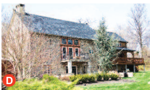
D 65 Reservoir Road Quakertown $749,000 From Quakertown: 309 N to Reservoir Rd, Prop on L