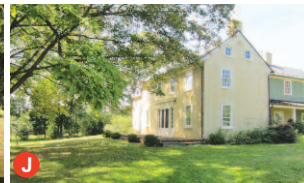
J 272 E. Dark Hollow Pipersville $990,000 River Rd N, L on Dark Hollow, pass Cafferty and Municipal. Prop on R